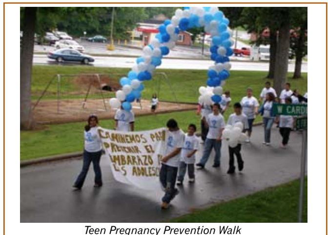
Teen Pregnancy Prevention Walk

Hablando Claro/Plain Talk is a teen pregnancy prevention program primarily serving Latino adults in Siler City. CCT! boasts not only being the first program of its kind in North Carolina, but also part of a national network of programs created by the Annie E. Casey Foundation. Hablando Claro/Plain Talk promotes and teaches parents how to communicate effectively with their adolescents about risky behaviors. Promotoros, or Walkers and Talkers, recruit families to participate. Through "Home Health Parties" friends and neighbors gather to share food and stories, learn factual information and ask questions. Nationally, these programs have shown lower pregnancy rates among teens by 10% when parents become "ask-able adults."