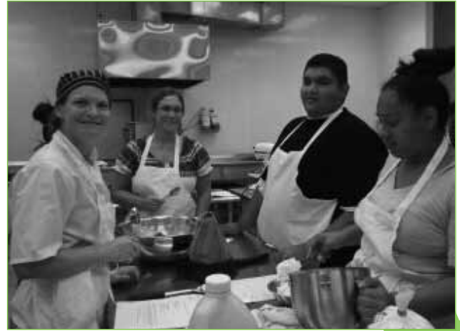
Students prepare a meal using farm to table techniques

Family Advocacy Youth who have become involved with the Office of Juvenile Justice and their parents receive support from a staff member as they learn about valuable communication skills, accountability and services to help them have success at a school, at home, and in the community. Present and former court-involved youth meet once or twice a week as a group for community service activities, recreation and education.