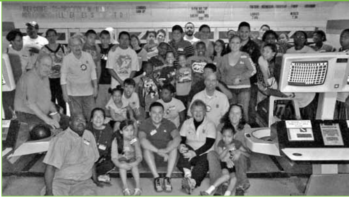
CCT! bowls at Sportsman's Lanes in Siler City