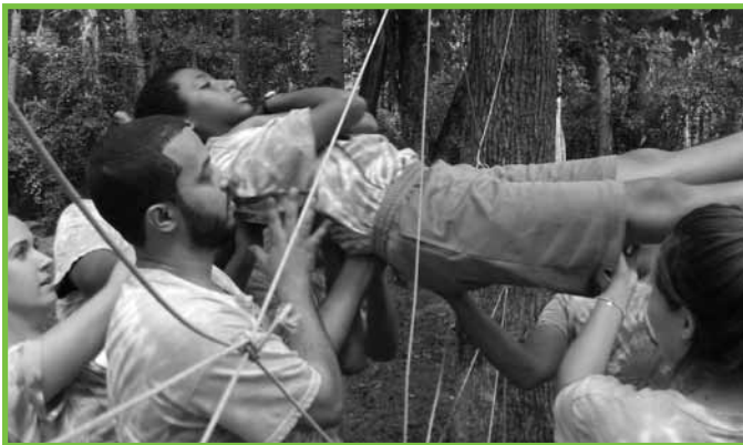
CCT! Staff and students support each other during a ropes course.